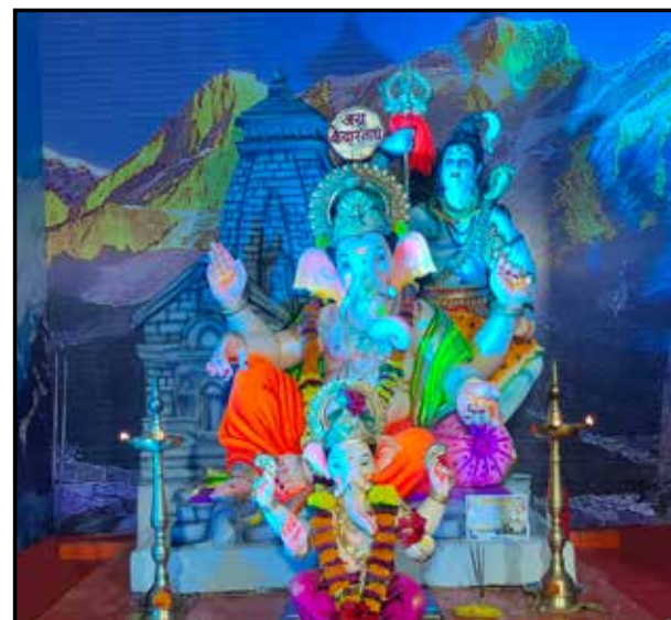
Shiv Prerna Mitra Mandal

Venue: N.S. Road, Mulund West. Highlight: A police station illuminated with dazzling lights