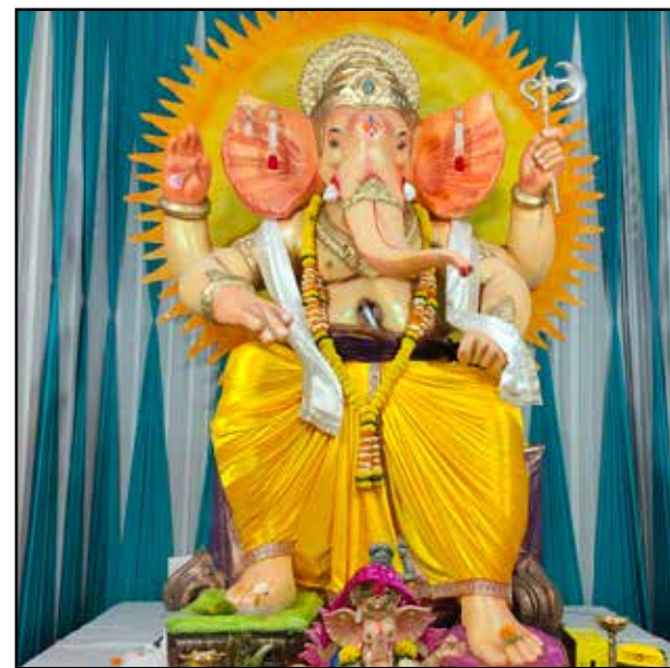
Sainath Mitra Mandal

Venue: Mulund Colony Years: 53, Height of Ganesh: 18 feet