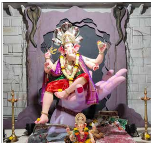
Adarsh Tarun Mitra Mandal

Venue: Dumping Road Nos. of Years: 3 Height of Ganesh: 5.5 feet