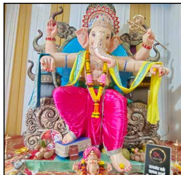
Vishwa Shanti Social Society Mitra

Dumping Road, Years: 28, Hight-10 feet, Highlight: Garuda: Bappa seated on Garuda