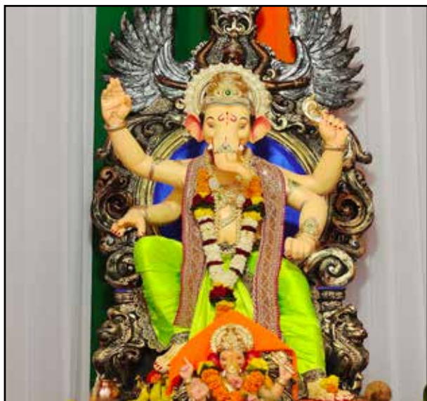
Achanak Mitra Mandal

Venue: Sainath Nagar, Mulund East Year: 16, Height of Ganesh: 16 feet