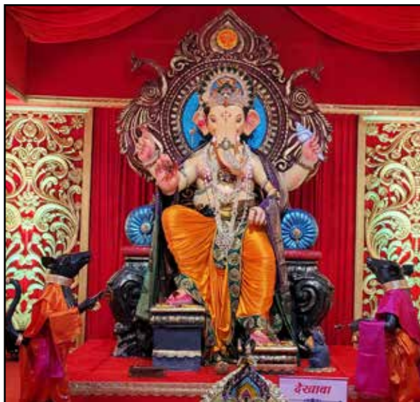
Sargam Mitra Mandal

Venue: Chandan Bagh Lane, Years: 59 Height of Ganesh: 13 ft, Tableau (Jhaki): A scene from Lal Mahal