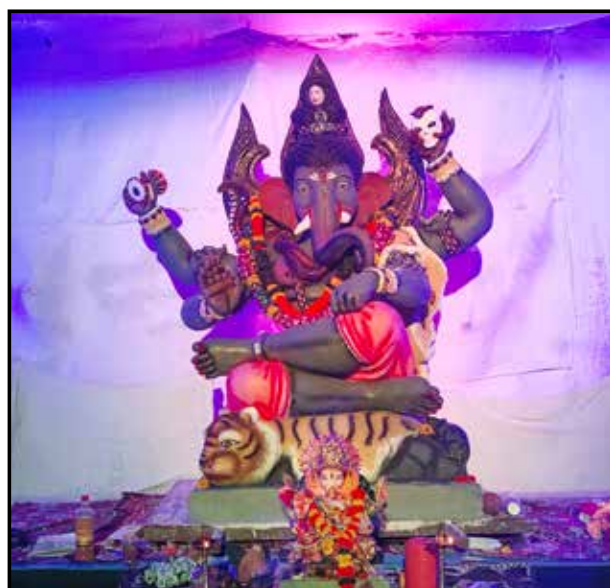
Shiv Sahyadri Mitra Mandal

(Vighnaharta of Tata Colony) Mulund E, Nos. of Years: 34, Height of Ganesh: 5 feet Tableau (Jhaki): A tableau of Kedarnath