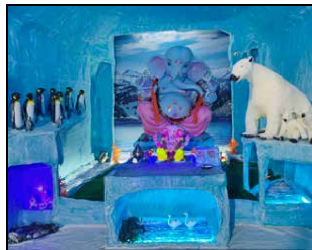
Shanti Nagar Rahavasi Sangh

Venue: Ashok Nagar, No of Years: 47 years, Height of Ganesh: 5 feet, Tableau (Jhaki): Varkari community backdrop