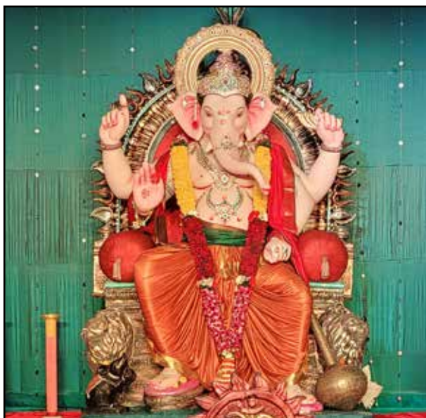
Dhruv Mitra Mandal

Venue: 90 feet of road, Mulund East Nos. of Years: 23