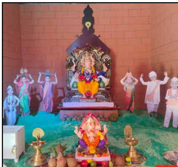
Ashtavinayak Mitra Mandal

Venue: Rohidas Nagar, Nos. of Years: 46 Height of Ganesh: 16 feet Highlight: Many social works