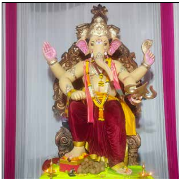
Maharashtra Mitra Mandal

Venue: Dumping Road, Mulund West Years: 29, Height of Ganesh: 14 feet