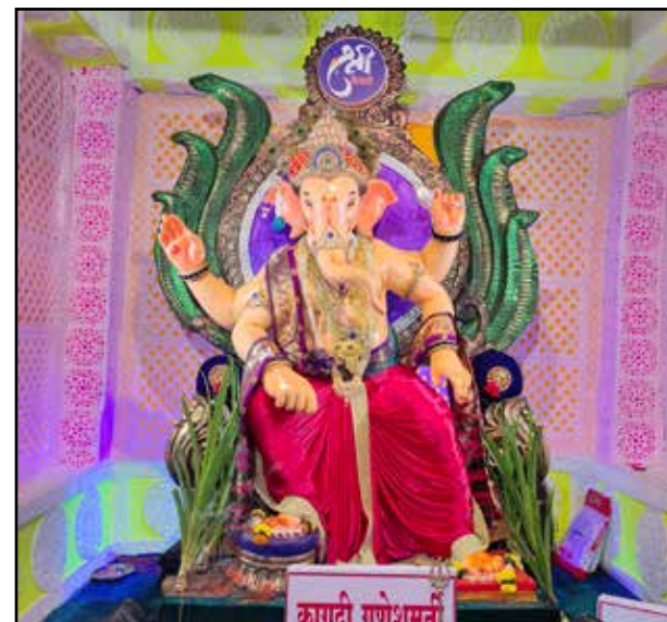
Sri Kesari Mitra Mandal

Venue: Siddharth Nagar Number of Years: 53 years Height of Ganesh: 8 feet