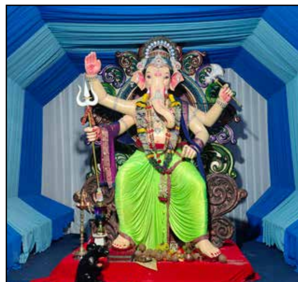
Azad Mitra Mandal

Venue: Nahur village Nos. of Years: 15, Height of Ganesh: 8 feet