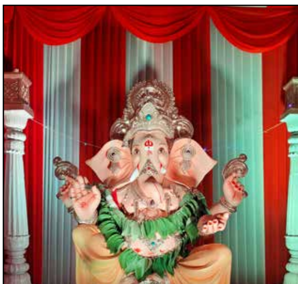
Sarvajanik Utsav Samiti Mandal

Venue: Neelam Nagar, Mulund East Height of Ganesh: 5.5 feet