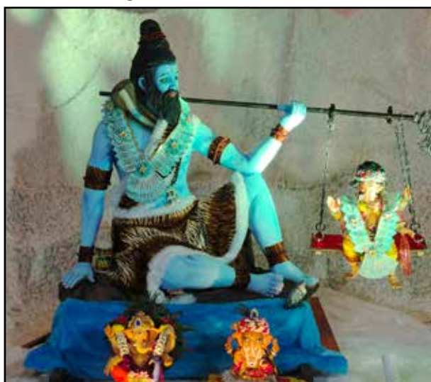
Shivaay Mitra Mandal

Venue: Mulund East The first Mandal in Mulund Height of Ganesh: 10 feet