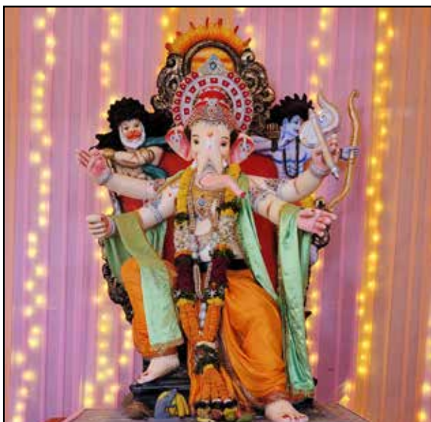
Sri Bal Gopal Mitra Mandal

Venue: Kothari Niwas of Mulund, West Nos. of Years: 40