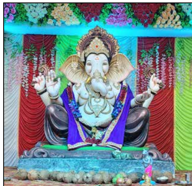
Neelam Nagar Ganesha Utsav Mandal,

Venue: Vishwakarma Nagar, Mullund West Height of Ganesh: 7 feet