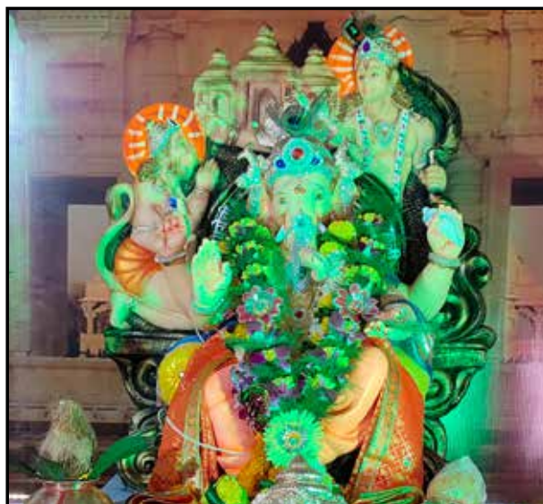
Mulund West Police Station

Venue: Mulund East. Highlight: Regular pooja and aarti by the police officers and staff