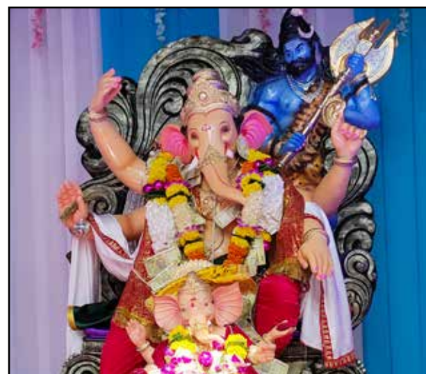
Surya Youth Foundation

Venue: Vijayanagar Mulund West Years: 16, Height : 6.5 feet, Highlights: Bappa seated upon the Sheshnag; eco-friendly