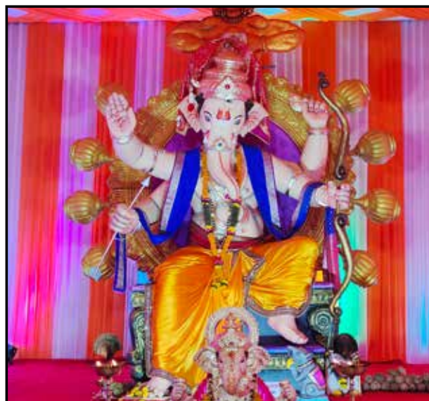
Ajinkya Mitra Mandal

Venue: Rohidas Nagar, Nos. of Years: 46 Height of Ganesh: 16 feet Highlight: Many social works