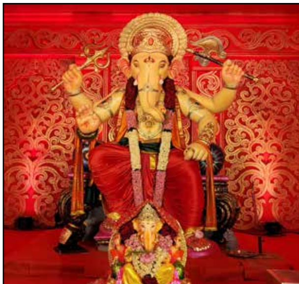
Sri Ganesh Mitra Mandal Patai Bappa

Venue: Chandan Bagh Lane, Years: 59 Height of Ganesh: 13 ft, Tableau (Jhaki): A scene from Lal Mahal