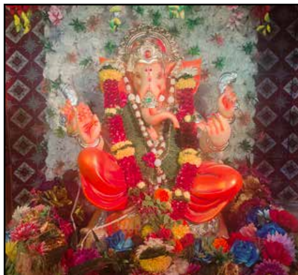
Navghar Police Station

Venue: Gaushala Road, Nos. of Years: 27 Highlight: Mulund's first eco-friendly Ganesh Utsav • Ganesh idol made of fibre in Iceland. Theme: To save the citizens from the destruction of global warming.