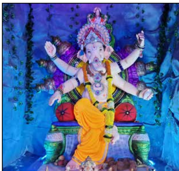
Shri Girija Mitra Mandal

Venue: J. N. Road, Mulund West No. of Years: 40, Height of Ganesh: 6.5 feet