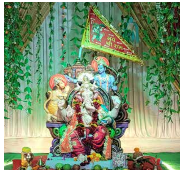
Navyuvak Mitra Mandal

Venue: RHB Road, Nos. of Years: 51 Height of Ganesh: 10 ft.