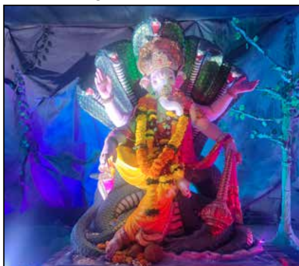
Shri Hanuman Seva Mandal

Venue: Devi Dayal Road, Nos. of Years: 1 Highlighted: Bappa is swinging from left to right on the Trishul of Lord Shiva's